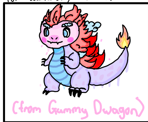
(from Gummy Dragon)